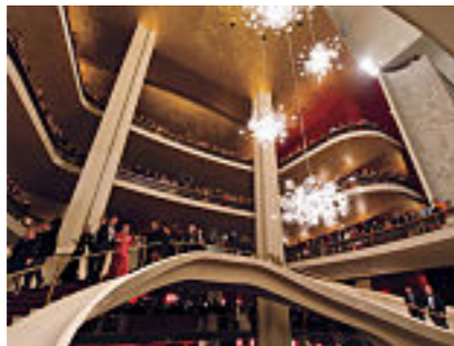
Charity Register: September 2013