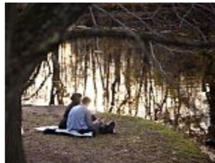
What We're Reading